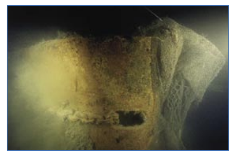
AE2's starboard bow draped in fishing nets

We are offering you the opportunity to become involved in this unique project to preserve one of Australia's few, remaining, and significant World War I relics and to ensure the story of its heroic crew is told.