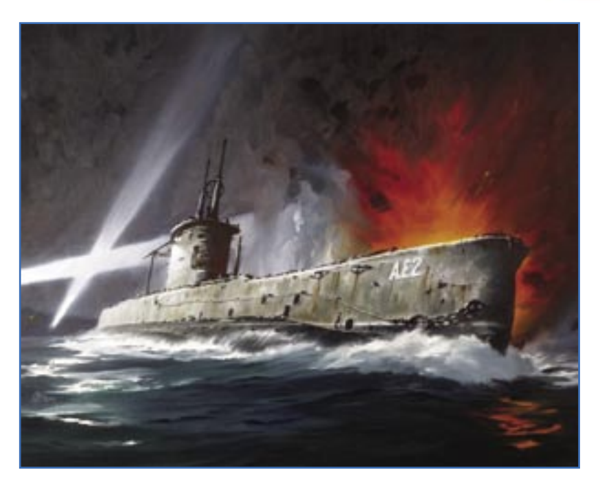
HMA Submarine AE2 'running amok in the Narrows'

So significant was the Australian submarine's achievement that it may have altered the course of the campaign, news of her passage arriving just as the evacuation of the ANZAC positions was being discussed by senior British commanders on the night of 25 April.